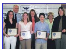
Lake Superior HS