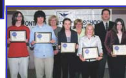
Nipigon-Red Rock DHS