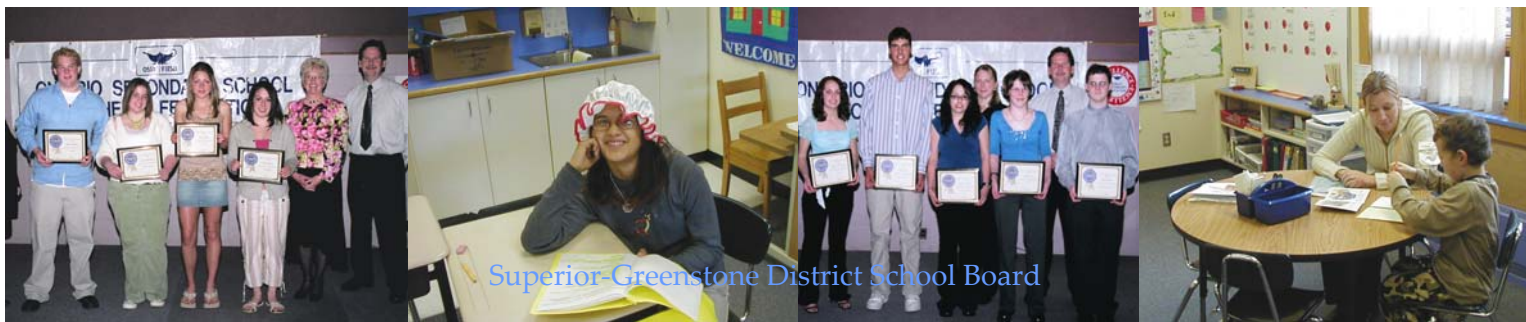
Superior-Greystone District School Board