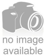
Annick Brewster French as Second Language